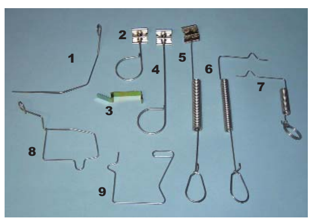
Some of the fastener available.

-may be combined to apply up to four stages of filtration.