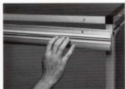
1. Mount the rear track. Hardware is provided for attachment to virtually any surface.

The innovative two-piece hookbead mounting system installs in minutes to any surface. All softwalls and strips come with the bonded hookbead. To install you simply hook the panels onto the track. Installation or replacement of the vinyl can be done from the front or by sliding the panels into or out of the track.