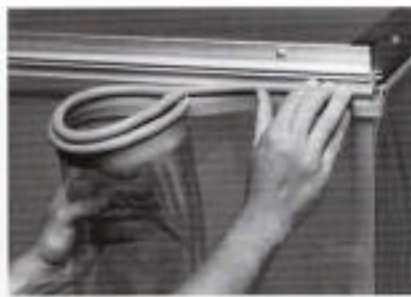
2. Unroll your new softwall panels and hook into place. Overlaps are automatic and strips are perfectly aligned every time.