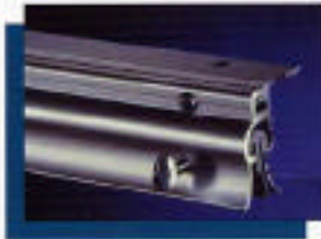
In-Jamb Ceiling Mounting for mounting under headers, frames or on horizontal surfaces.