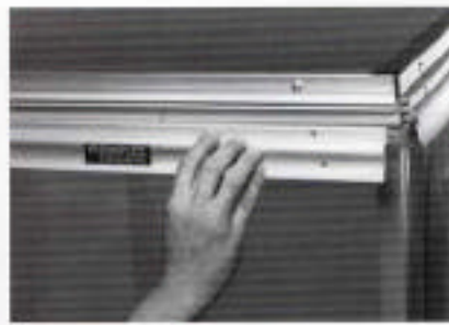
3. Attach front plate with machine screws provided. Your installation is complete.