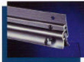
Flatwall Mounting for mounting on frames or vertical surfaces.