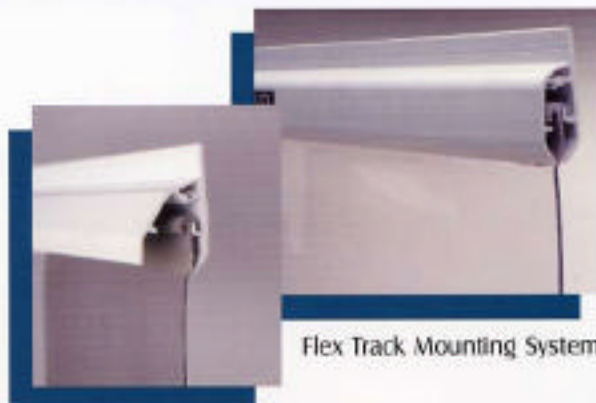
Flex Track Mounting System

The Flex Track mounting system from Simplex is a sleek, white, one-piece mounting track, fashioned from rigid PVC material and incorporates flexible hinge and bottom flanges. Mounting track, hinges and flange are extruded as one piece. The non-corrosive design, with no exterior mounting screws, eliminates exterior crevices where contamination can accumulate. Flex Track snaps open and snaps shut again and again for quick assembly and disassembly. Simply hook softwall strips and solid curtains onto the track and close the continuous cover.