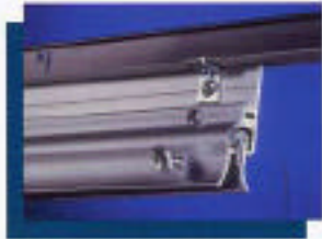
Suspended T-Bar Mounting for mounting onto existing 1", 1-1/2" or 2" suspended t-bar ceilings.