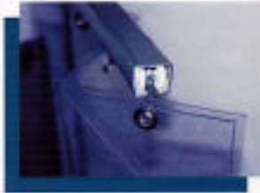
BI-Folding Curtain Mounting available in anodized aluminum, galvanized or stainless steel.

Simplex anodized aluminum mounting systems are designed to be an integral part of your cleanroom. Our two piece hookbead mounting tracks make installation of even large softwalls simple. Our exclusive t-bar clip design allows you to attach to your existing t-grid ceiling without any drilling. This allows you to easily change configurations without damage to your expensive cleanroom ceiling system. Options include epoxy powder coating or anodizing in colors to match your equipment or decor.